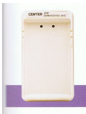
Center 345 Communication Base

Postal Address Homersham Ltd PO Box 280 Christchurch 8140 NEW ZEALAND